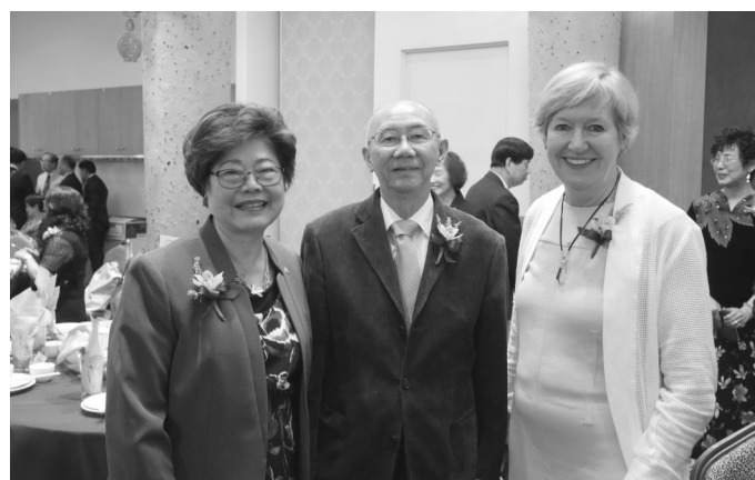
Spoke at the Shon Yee Benevolent Association's 102nd Anniversary Dinner May 22, 2016