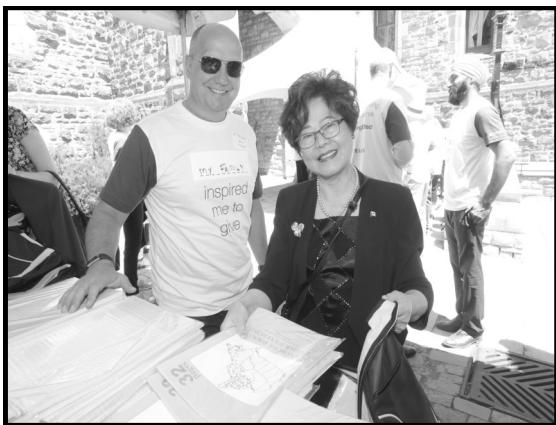
On May 31, 2016, I was pleased to participate in TELUS' Days of Giving on Parliament Hill event.

Now that summer has come to an end and we are now looking forward to a new year, I hope you have all had time to rejuvenate and enjoy time with your families and loved ones.