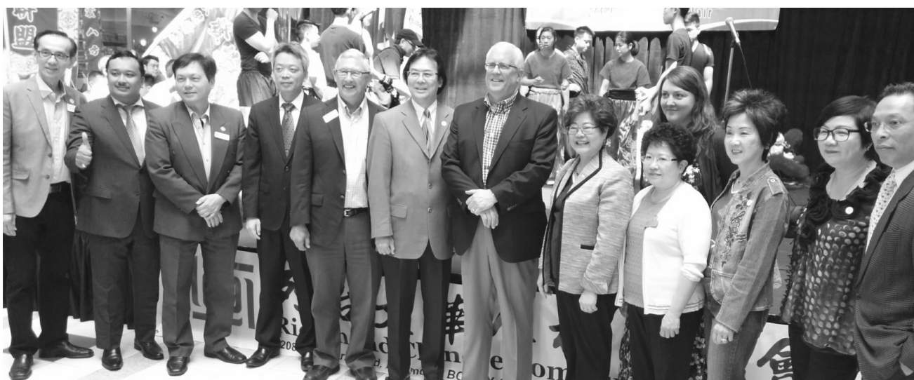
Attended the Richmond Chinese Community Society Heritage Festival May 14, 2106

Unfortunately, the Liberals have refused to tell us the exact cost of this CPP tax hike. Whether by raising taxes on young people, decreasing their ability to save tax-free, or shrinking their paychecks through a CPP tax-hike, this Liberal government is making life unaffordable for you.