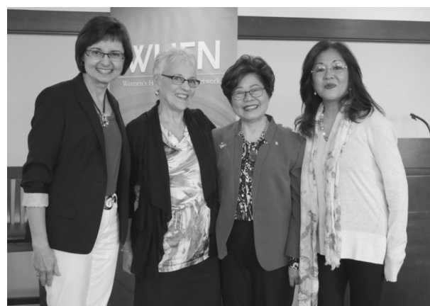
Attended the Women's Heart Engaging Network Tea May 21, 2016