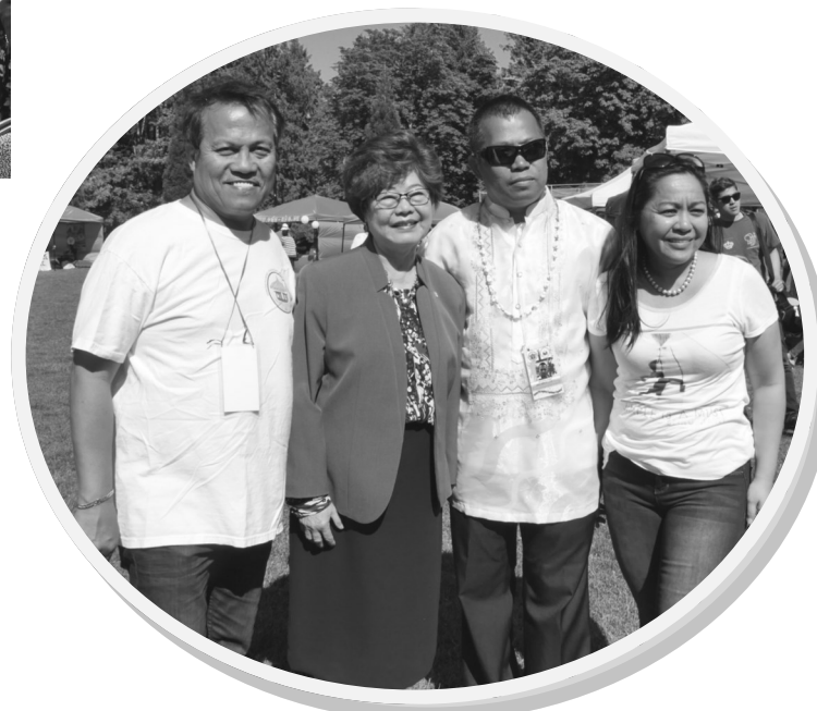
Stopped by the Philippine Independence Day Celebration In Vancouver June 4, 2016