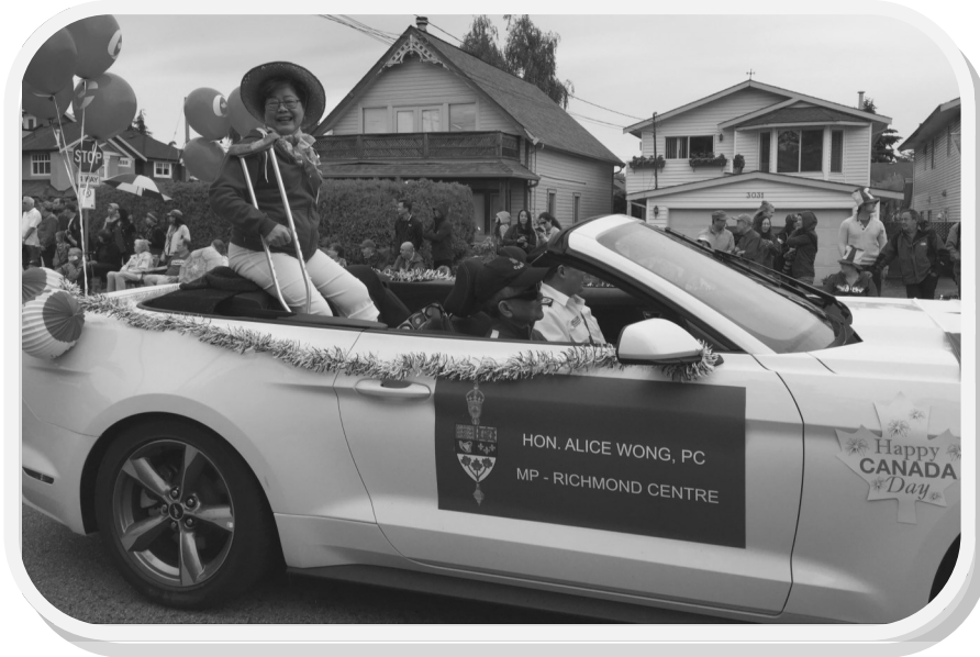
Participated in the Annual Canada Day Parade at the Steveston Salmon Festival July 1, 2016