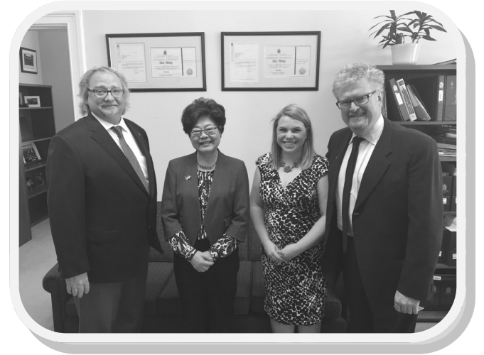
Met with representatives of the Canadian Dental Association in my Ottawa Office May 11, 2016

Why would the Liberals refuse to ask Canadians for their opinion on this important matter? If their position is so strongly supported, that result should be reflected in a referendum! Please let me know if you agree that no matter the change, a referendum is crucial.